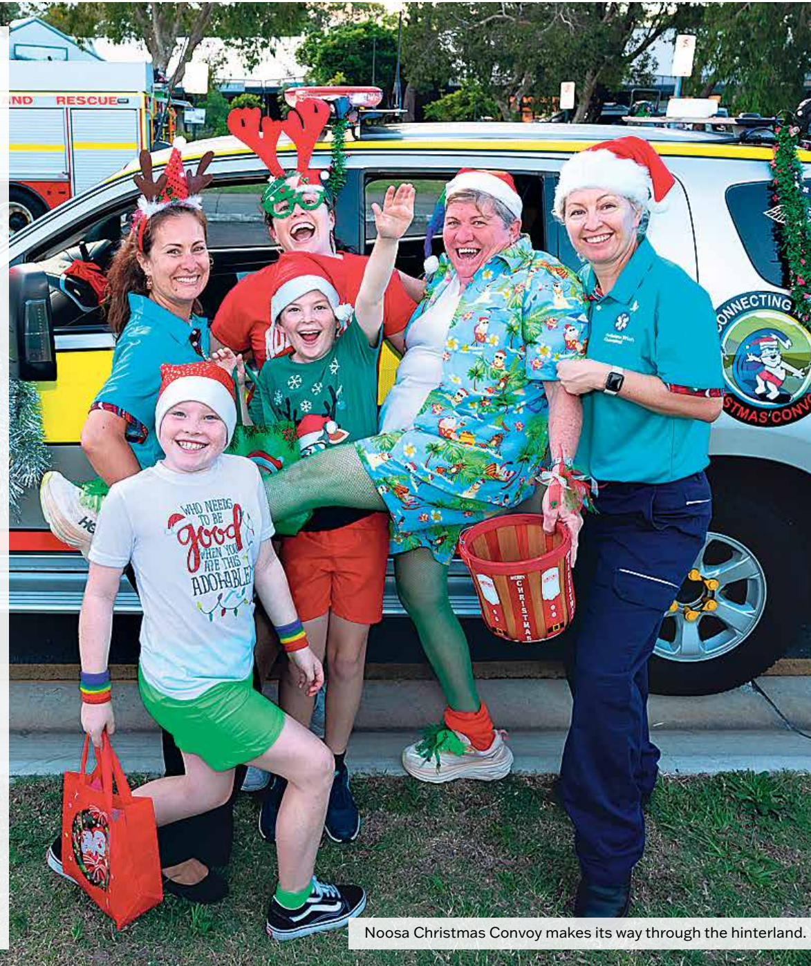
Noosa Christmas Convoy makes its way through the hinterland.

Supported by Hot91, Tewantin Noosa RSL and Crackerjack Cooroy, convoy routes are available on Council's website – noosa.qld.gov.au . Don't miss it!