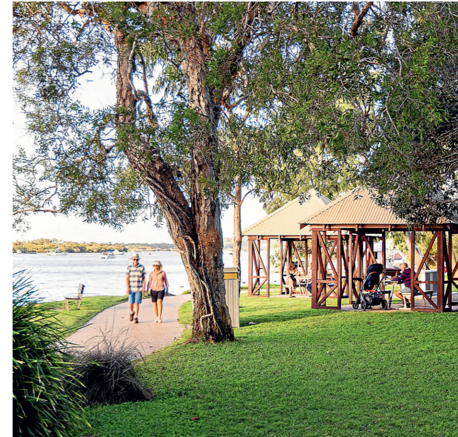
Noosa residents value nature, open space and safety most, including areas like Noosaville foreshore.

Noosa's natural environment, public open space and sense of safety top the list of what residents value most in the shire.