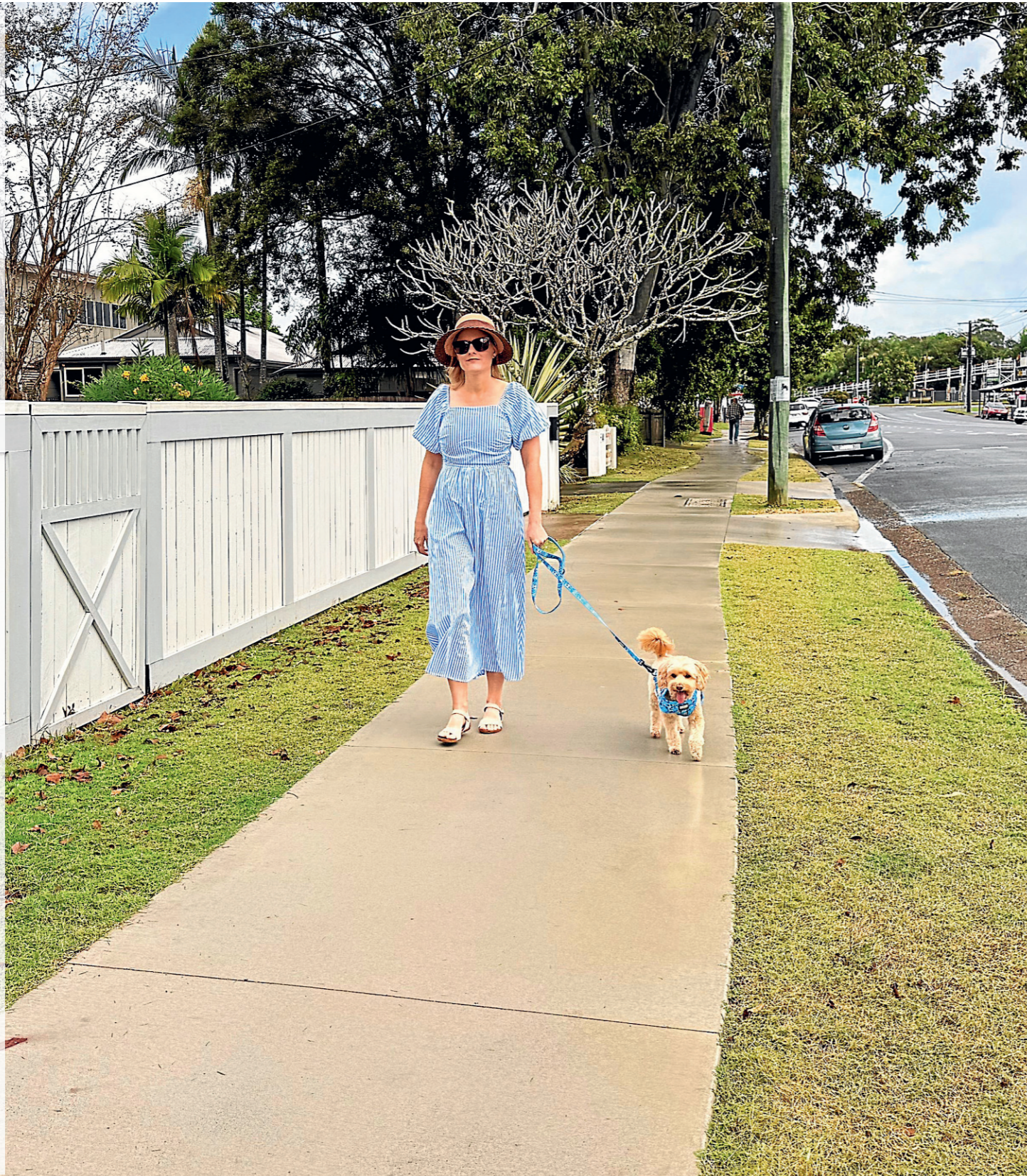
Council has completed a number of pathway upgrades, including Diamond St in Cooroy, as part of its Pathways Renewals Program.

More pathway renewals are planned across the shire this year.