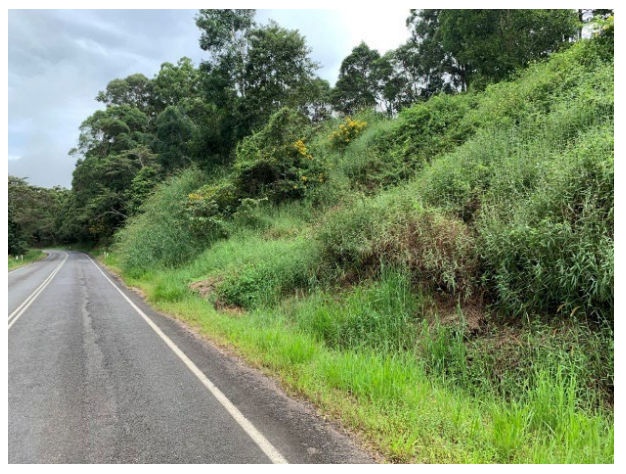
Landslide above 490 Cooroy-Belli Creek Road

FKG Civil Pty Ltd (FKG) has been awarded the contract to undertake works near 490 Cooroy-Belli Creek Road. The construction will repair landslide damage on the upslope and downslope of the road.