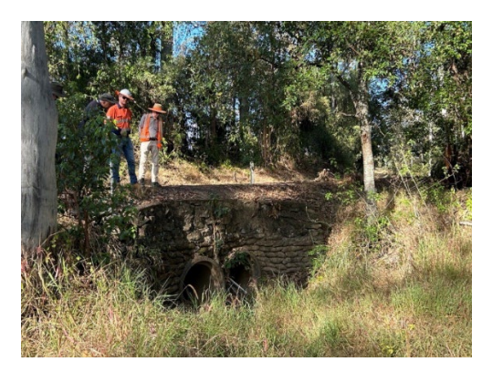
Damaged culvert near Schreibers Road on Coles Creek Road.

Construction will generally occur Monday to Friday between 6.30am and 5.30pm. Typical construction noise can be expected.