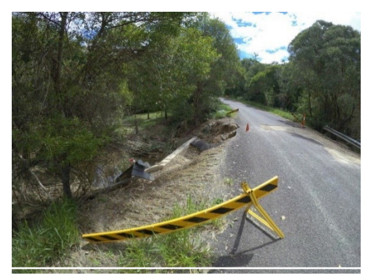
Damaged culvert near Schreibers Road and Coles

The construction program will include the use of heavy machinery, delivery of materials, demolition and concreting works.