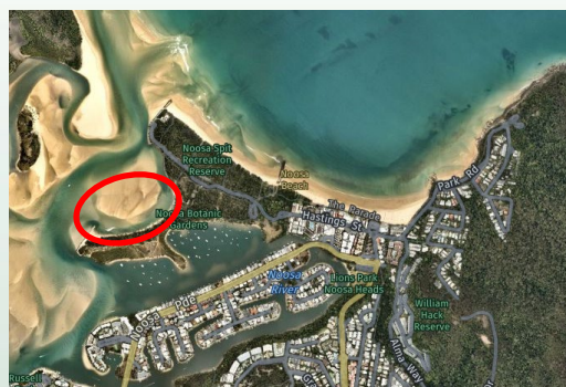
Location of work

Prior to the sand nourishment works commencing, vegetation and pathways that have fallen into the river as a result of the erosion will be removed.