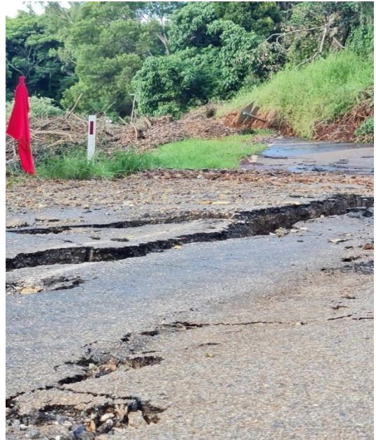
Black Mountain Road landslip (above)