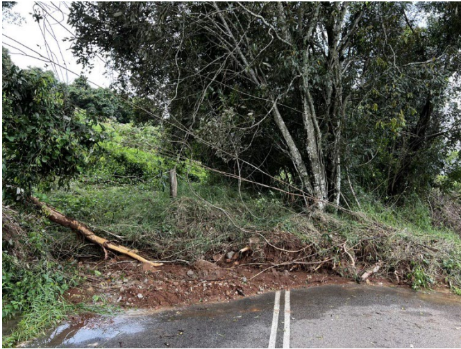
Black Mountain Road landslip (above)