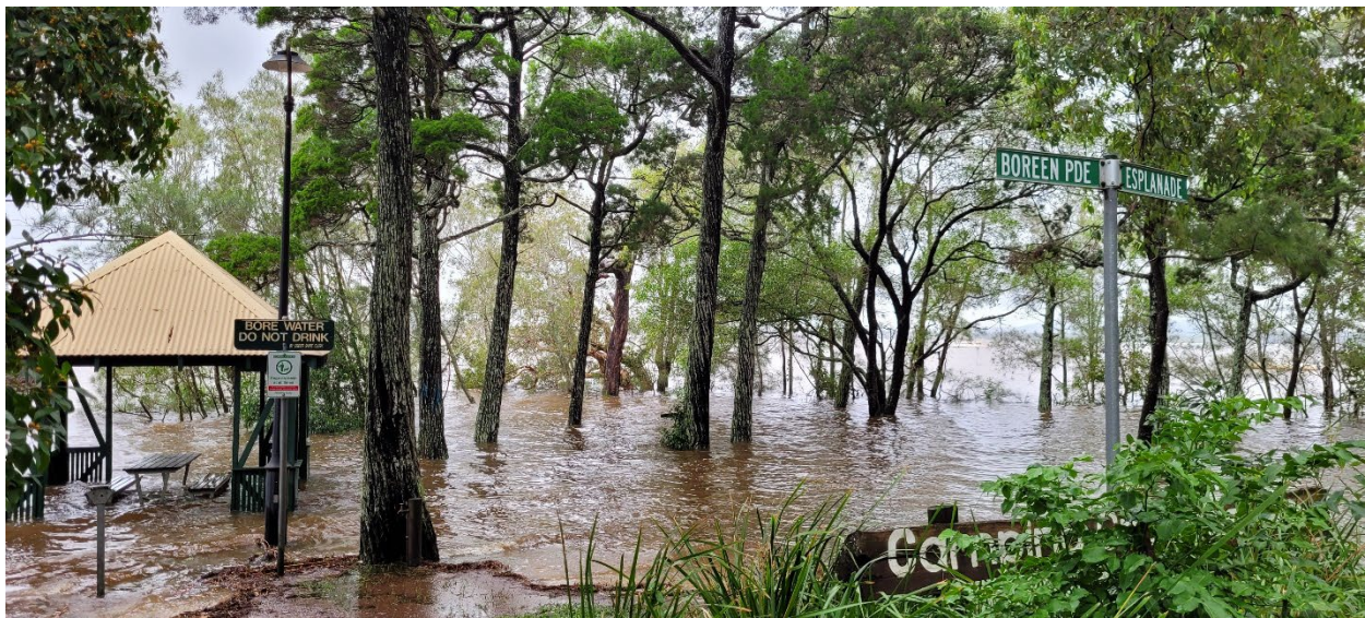
Boreen Point Camping Ground (below)