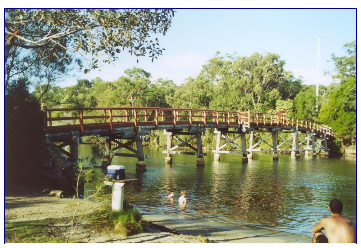
Weyba Creek Bridge as it appears today

DESCRIPTION Arched wooden pedestrian bridge