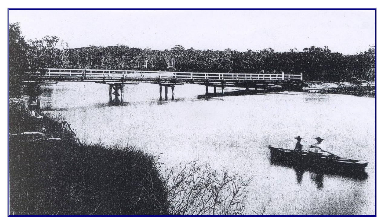
1886 photograph showing "Alexandra Bridge"

This bridge was of timber construction and, although it may have proved adequate for the needs of its time of construction, it soon proved to be unequal to coping with the requirements of modern transport in such areas as the greatly increased sizes of trucks and passenger coaches. The widths of these vehicles in particular made passing on the bridge impossible and their weights were too much for the structure to carry. There was also the greatly increased volume of traffic using the bridge with the growth of Noosa Heads and Sunshine Beach.