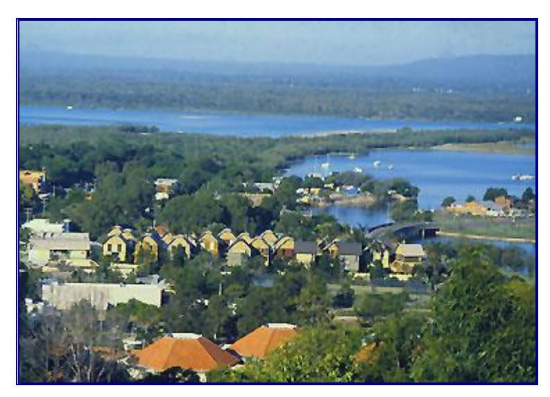
Overlooking 'The Hastings' from the lookout, Noosa National Park

Raised above the ground on a steel substructure, each unit provided carparking underneath. Because the only other steel used in the building was in the floor framing, the walls were made more substantial than a single-skin. Instead they were positioned on the floor and locked together. The second floor steel frame was then lifted by crane and attached to the walls already in position. This process was repeated for the second storey walls. The roof was assembled on the ground and included all fittings such as down pipes and vents. When completed the structure was lifted by crane into position.